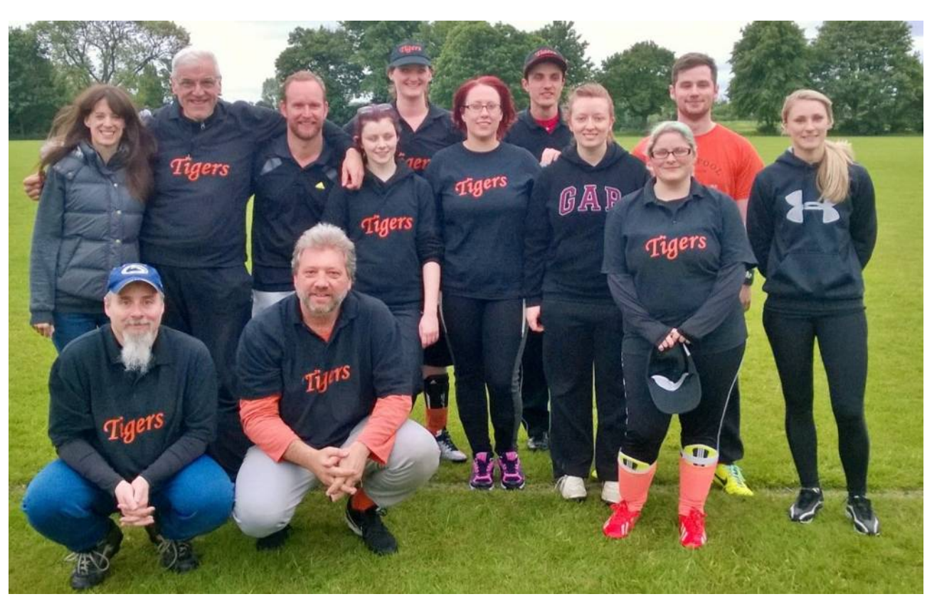
Review of the year